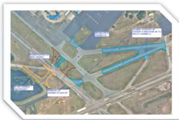
BP-49 Project Limits

Loyal Wingman, LLC, is pleased to submit this proposal to provide support to your team for the program and project management of project BP-49, Taxiways A, B, & E4 Rehabilitation, at the Orlando Executive Airport. The BP-049 project provides for the removal of Taxiway E5 (approximately 235 feet long x 75 feet wide) and Taxiway E4 (approximately 205 feet long x 60 feet wide) to comply with the current FAA geometric standards required for runway incursion mitigation as identified in the FAA approved ALP. The project includes rehabilitation of existing Taxiway A between Runway 13-31 and Taxiway E (approximately 135 feet long x 50 feet wide) and between Taxiway E and Taxiway A5 (approximately 1,175 feet long x 50 feet long) as identified in the 2019 FDOT Airfield Pavement Management Program report. In addition, rehabilitation of existing Taxiway B between Taxiway E5 and Taxiway A5 (approximately 1,100 feet long x 50 feet long) as identified in the 2019 FDOT Airfield Pavement Management Program report will be included. Rehabilitation of Taxiway B1 is also required for the project.