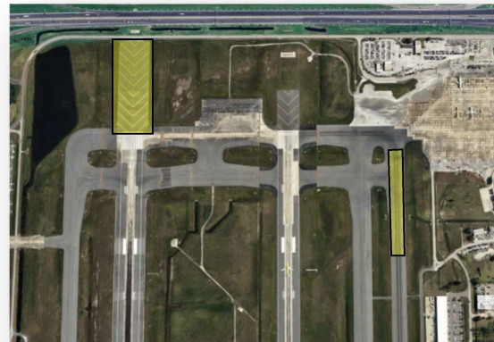
Project Locations – Miscellaneous Pavement Rehab

The project scope at the blast pad will be generally to rehabilitate the blast pad pavement. The current blast is far larger than required, so the initial task will be to demolish the unneeded portions of the blast pad. The remaining limits will be milled and resurfaced. The demolished portion will be graded and sodded. Finally, pavement markings will be applied.