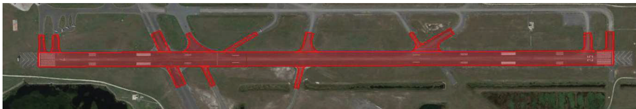
Figure 1: Limits of Work

GOAA has requested KH to provide rehabilitation strategies and opinions of probable construction costs for up to three (3) alternatives. The Scope of Work is for the initial planning work for identification of the preferred alternative/approach to rehabilitation, including a site visit, records review, pavement design and rehabilitation strategies preparation, and program-level OPCCs for each alternative. No survey, geotechnical investigations, or non-destructive testing (NDT) is to be performed as part of this scope. The OPCCs will include the costs for rehabilitating the pavements, upgrading the pavement geometry, marking, lighting, guidance signs and runway safety area to meet the FAA standards.