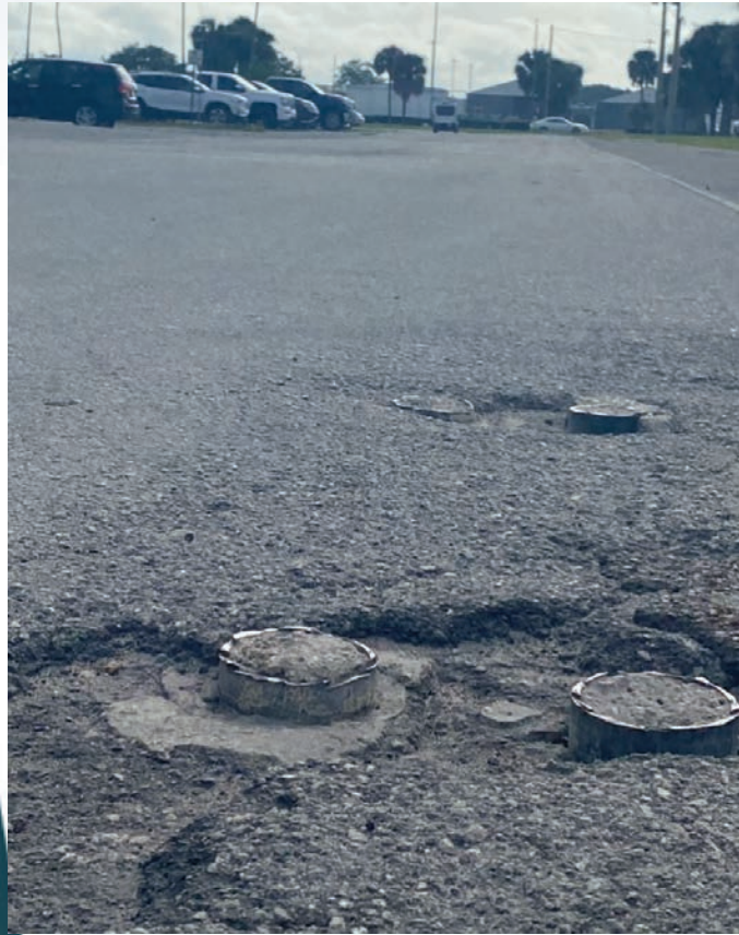
East Amelia St