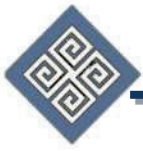
EXHIBIT One Materials Testing Services March 10, 2023 EEC PRO 189